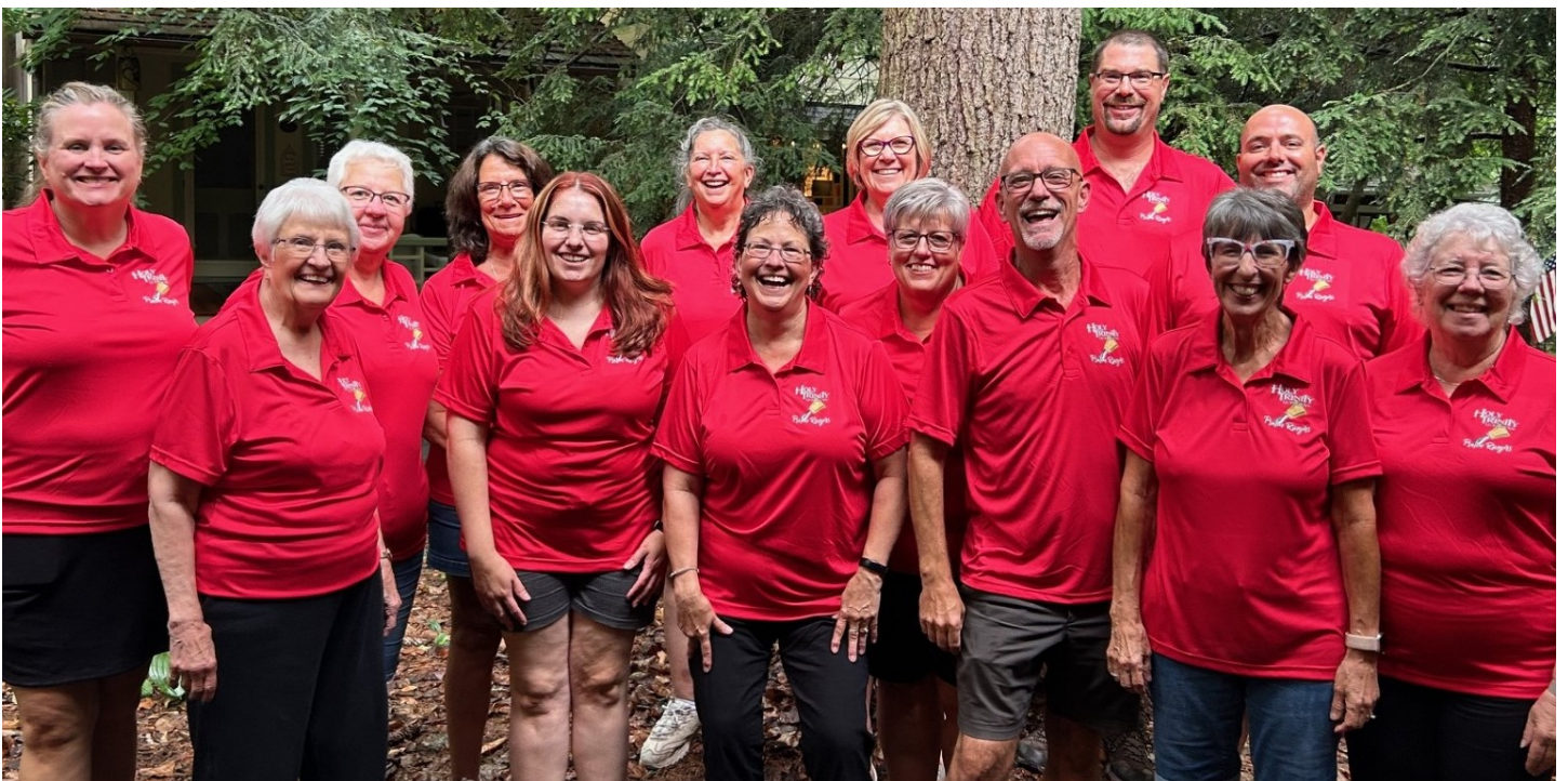
Psalm Ringers at the Mt. Gretna Handbell Festival on August 3